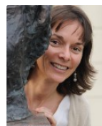
Nicola Spaldin ETH Zurich